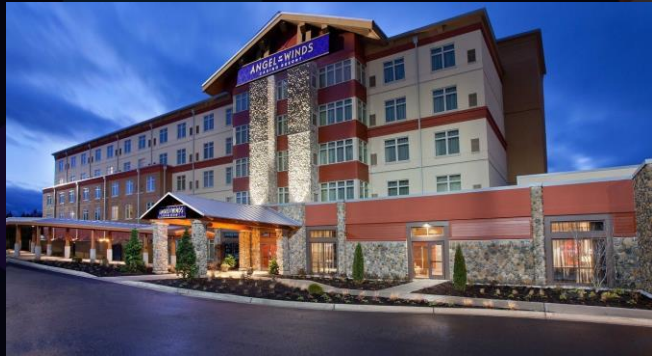
ANGEL OF THE WINDS CASINO RESORT