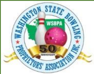
Director – Region 1